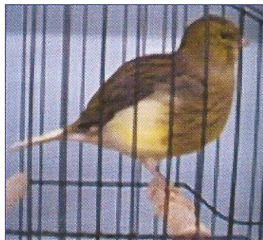
2012 Best in Show Winner