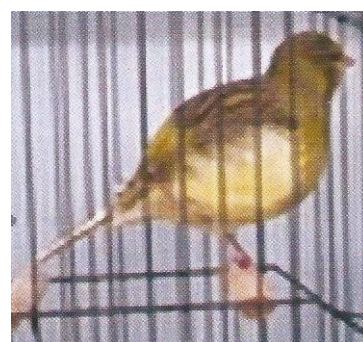
2012 Best in Show Winner