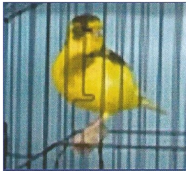
2012 Best in Show Winner